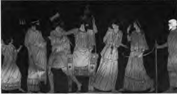
Fig. 11. Birth of Athena from the head of Zeus.

Her did Zeus the counselor beget from his holy head all armed for war in shining golden mail, while in awe did the other gods behold it. Quickly did the goddess leap from the immortal head, and stood before Zeus, shaking her sharp spear, and high Olympus trembled in dread beneath the strength of the gray-eyed maiden,